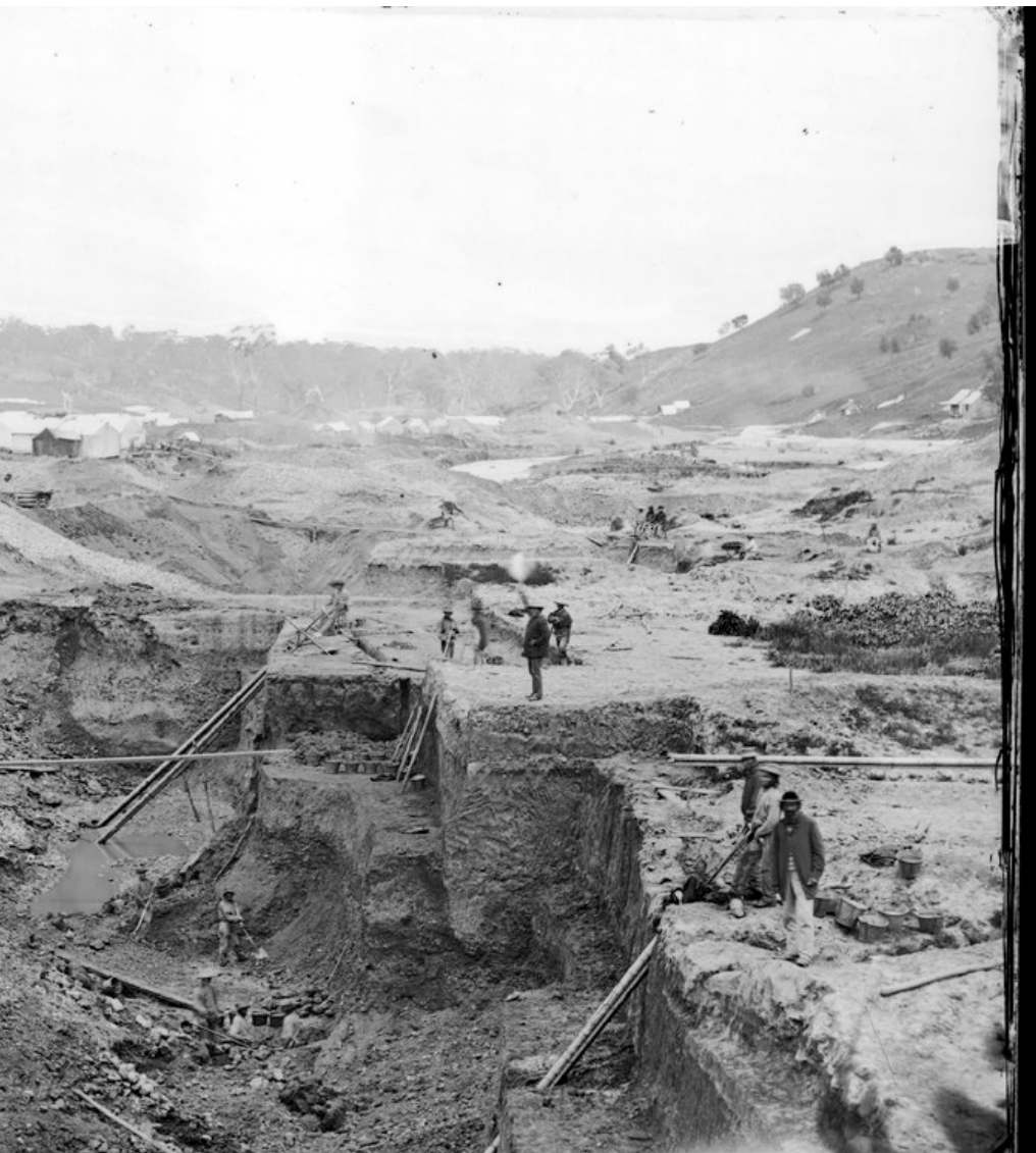
for riches, early Guildford resembled a quarry.