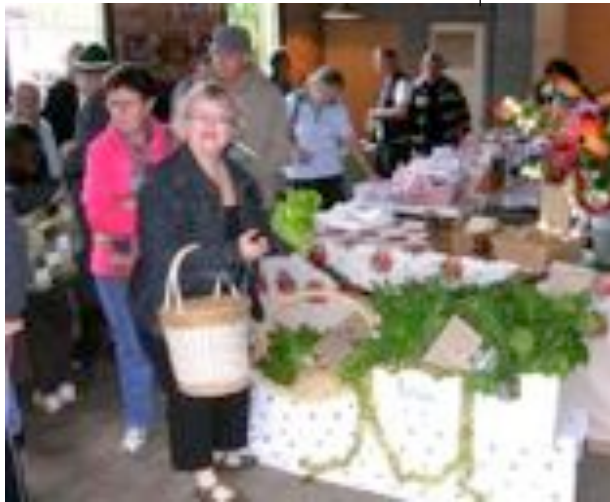
The move from the Music Hall will certainly ease the squeeze

If you are interested in having a stall call 5476 4327 or 0407 305 939.