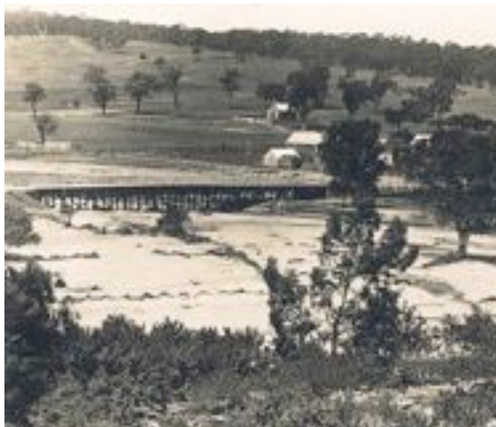
They say that gold mining in the area came to a tumultuous end when the great flood of 187