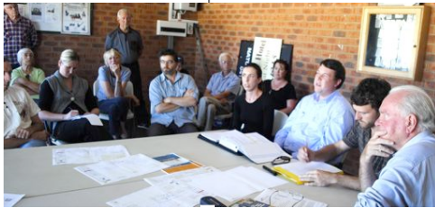
Big turnout at NBN meet.

"NBNC Co is committed to ensuring its Fixed Wireless network complies with the Australian Safety