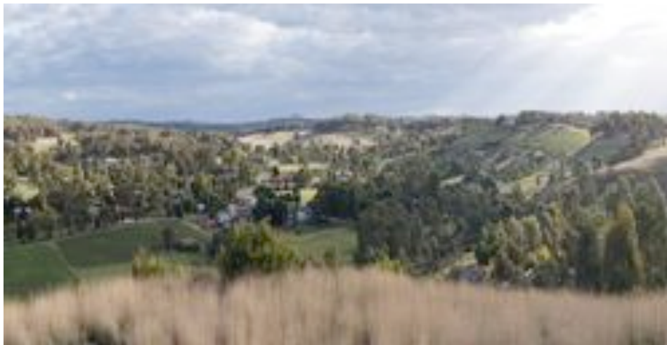
How far is it?

The Council says the erection of a tower of this nature does come under