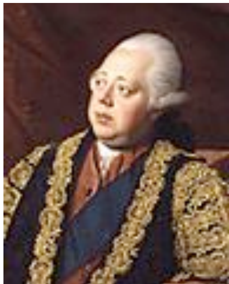
Maitland, First Duke of Lauderdale.

The title was created for the first time in the Peerage of Eng-