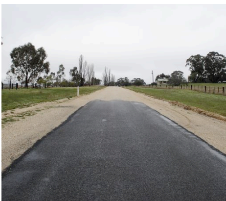
The beginning of the unsealed section of the Glenluce road